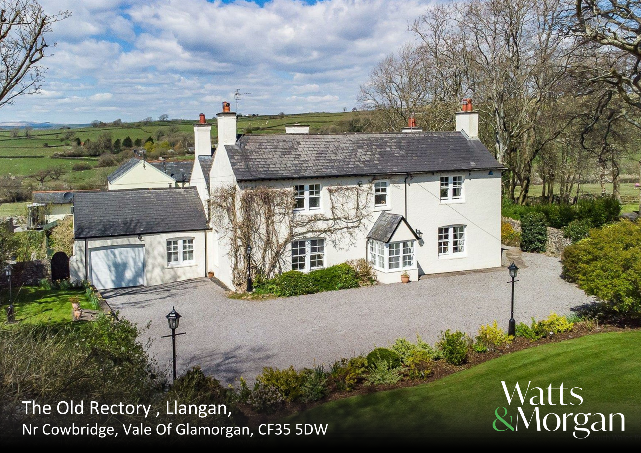
The Old Rectory , Llangan, Nr Cowbridge, Vale Of Glamorgan, CF35 5DW